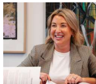
LEADERSHIP AND MANAGEMENT